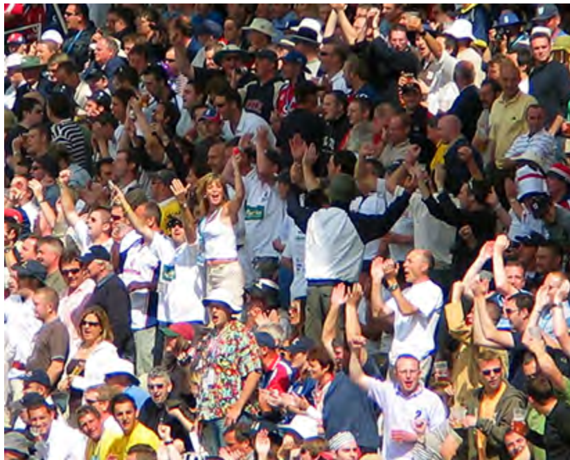
Figure 1.2 Sociologists learn about society as a whole while studying one-to-one and group interactions.