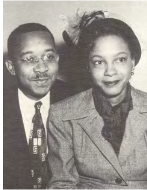
Figure 1.9 The research of sociologists Kenneth and Mamie Clark helped the Supreme Court decide to end “separate but equal” racial segregation in schools in the United States.

When Elizabeth Eckford tried to enter Central High School in Little Rock, Arkansas, in September 1957, she was met by an angry crowd. But she knew she had the law on her side. Three years earlier in the landmark Brown vs. the Board of Education case, the U.S. Supreme Court had overturned twenty-one state laws that allowed blacks and whites to be taught in separate school systems as long as the school systems were “equal.” One of the major factors influencing that decision was research conducted by the husband-and-wife team of sociologists, Kenneth and Mamie Clark. Their research showed that segregation was harmful to young black schoolchildren, and the Court found that harm to be unconstitutional.