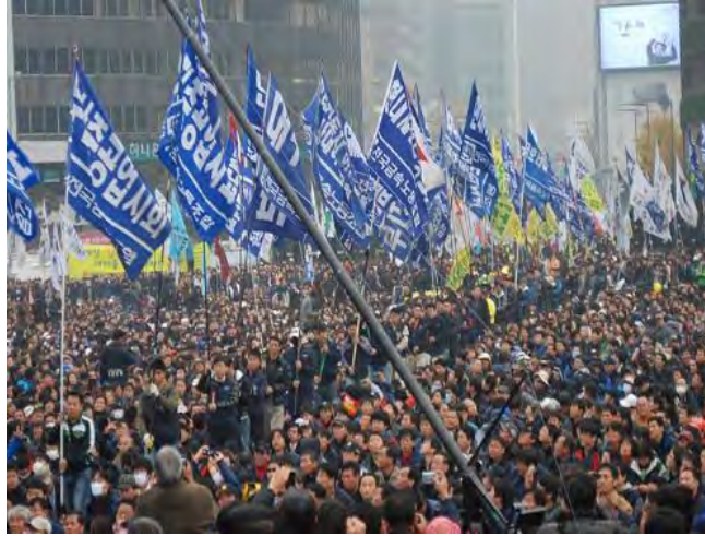
Figure 1.7 Sociologists develop theories to explain social occurrences such as protest rallies.

Sociologists study social events, interactions, and patterns, and they develop a theory in an attempt to explain why things work as they do. In sociology, a theory is a way to explain different aspects of social interactions and to create a testable proposition, called a hypothesis , about society (Allan 2006).