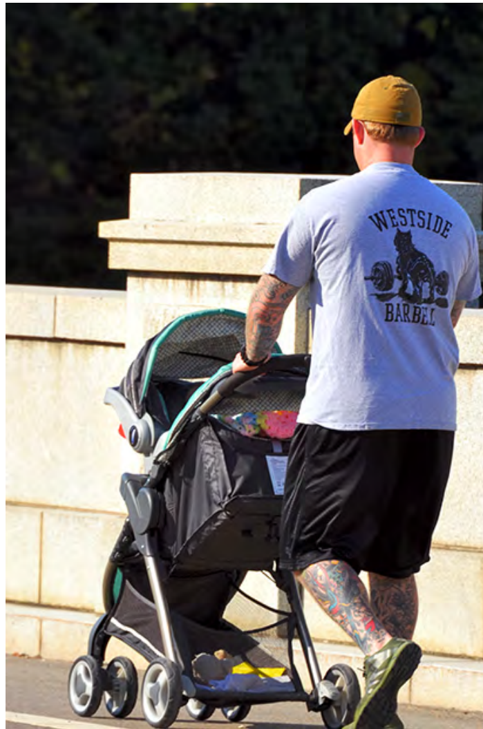
Figure 1.3 Modern U.S. families may be very different in structure from what was historically typical.

Another example of the way society influences individual decisions can be seen in people's opinions about and use of the Supplemental Nutrition Assistance Program, or SNAP benefits. Some people believe those who receive SNAP benefits are lazy and unmotivated. Statistics from the United States Department of Agriculture show a complex picture.