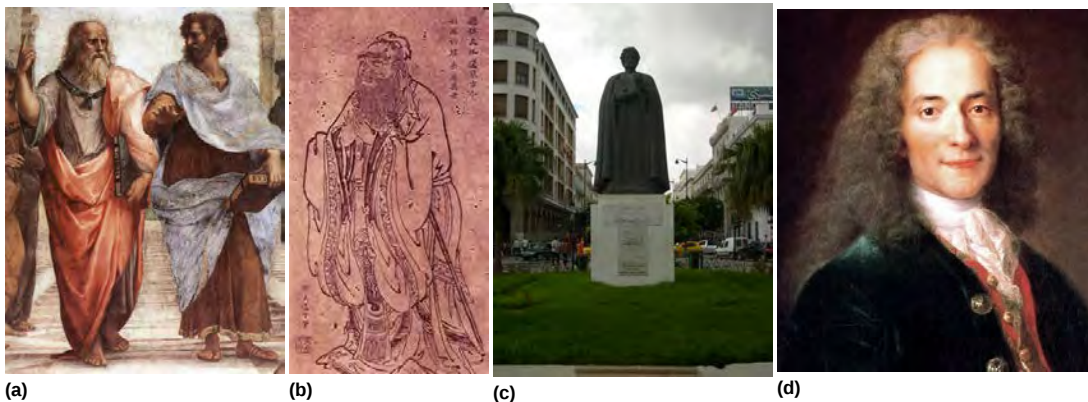
Figure 1.4 People have been thinking like sociologists long before sociology became a separate academic discipline: Plato and Aristotle, Confucius, Khaldun, and Voltaire all set the stage for modern sociology.

Since ancient times, people have been fascinated by the relationship between individuals and the societies to which they belong. Many topics studied in modern sociology were also studied by ancient philosophers in their desire to describe an ideal society, including theories of social conflict, economics, social cohesion, and power (Hannoum 2003).