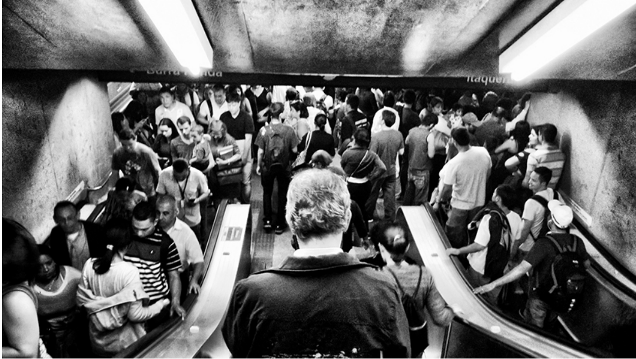
Figure 1.1 Sociologists study how society affects people and how people affect society.