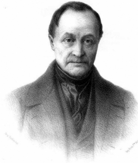
Figure 1.5 Auguste Comte played an important role in the development of sociology as a recognized discipline.