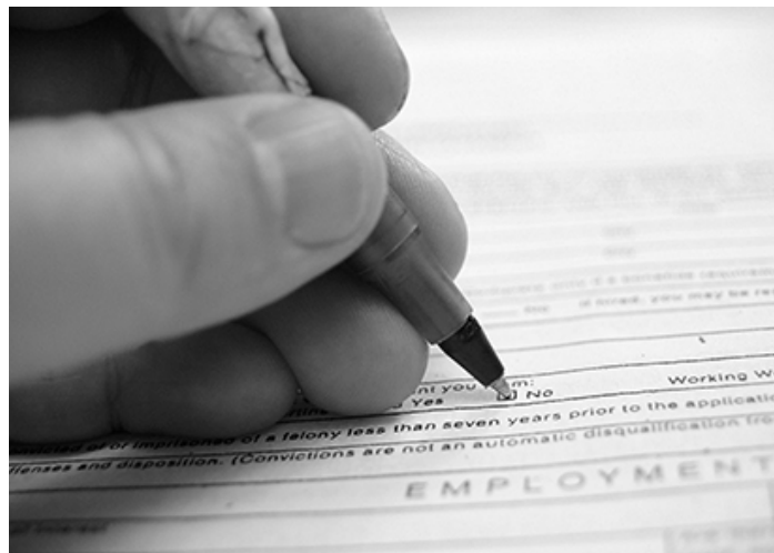
Figure 2.3 Questionnaires are a common research method; the U.S. Census is a well-known example.

As a research method, a survey collects data from subjects who respond to a series of questions about behaviors and opinions, often in the form of a questionnaire. The survey is one of the most widely used scientific research methods. The standard survey format allows individuals a level of anonymity in which they can express personal ideas.