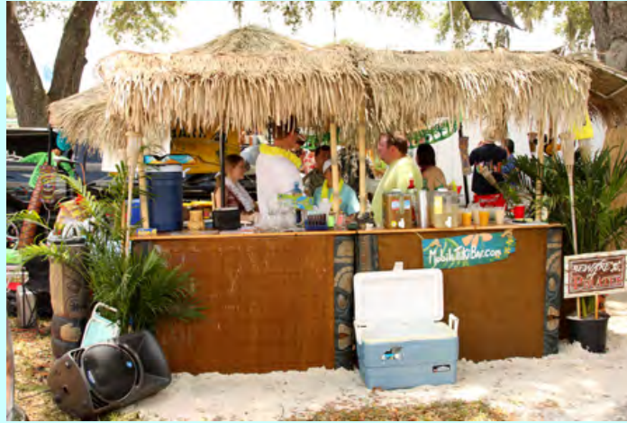
Figure 2.6 Business suits for the day job are replaced by leis and T-shirts for a Jimmy Buffett concert.

Some sociologists study small groups of people who share an identity in one aspect of their lives. Almost everyone belongs to a group of like-minded people who share an interest or hobby. Scientologists, folk dancers, or members of Mensa (an organization for people with exceptionally high IQs) express a specific part of their identity through their affiliation with a group. Those groups are often of great interest to sociologists.