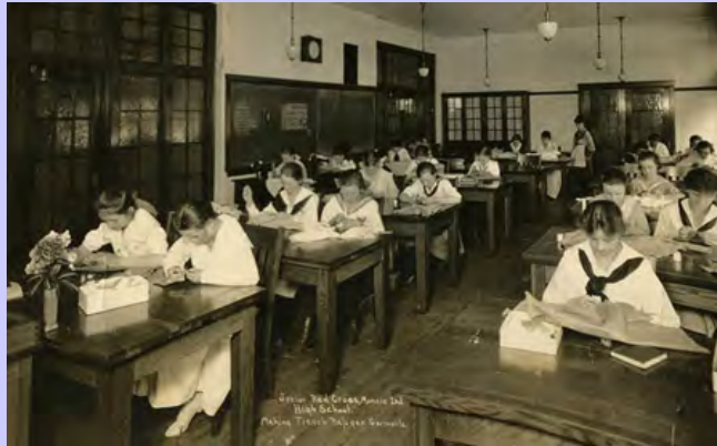
Figure 2.9 A classroom in Muncie, Indiana, in 1917, five years before John and Helen Lynd began researching this “typical” U.S. community.

the sociological methods and the use of scientific data to define ordinary people in the United States. The book was proof that social data was important—and interesting—to the U.S. public.