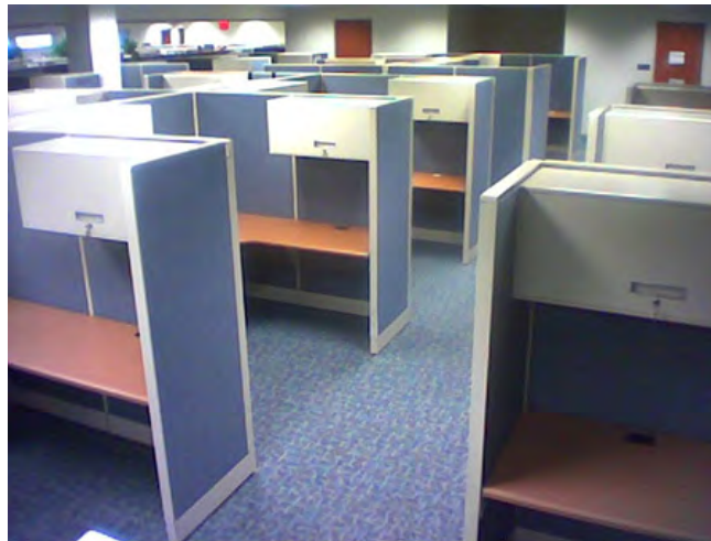
Figure 2.8 Field research happens in real locations. What type of environment do work spaces foster? What would a sociologist discover after blending in?

Nickel and Dimed: On (Not) Getting By in America , the book she wrote upon her return to her real life as a well-paid writer, has been widely read and used in many college classrooms.