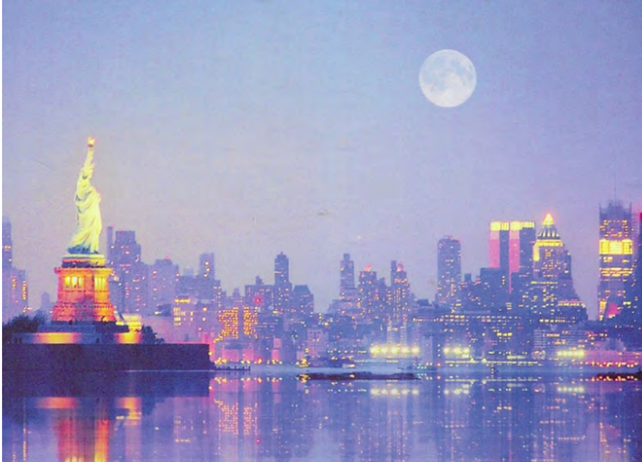
Figure 2.1 Many believe that crime rates go up during the full moon, but scientific research does not support this conclusion.