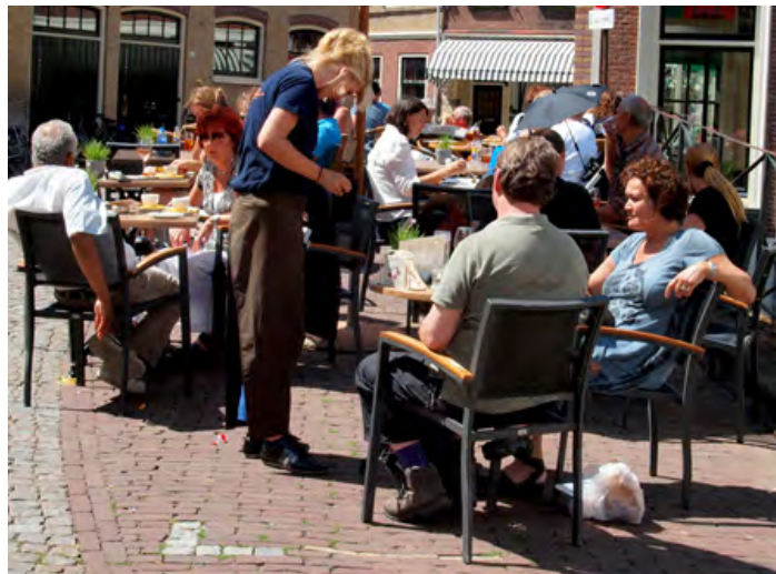
Figure 2.7 Is she a working waitress or a sociologist conducting a study using participant observation?

Rothman had conducted a form of study called participant observation , in which researchers join people and participate in a group’s routine activities for the purpose of observing them within that context. This method lets researchers experience a specific aspect of social life. A researcher might go to great lengths to get a firsthand look into a trend, institution, or behavior. Researchers temporarily put themselves into roles and record their observations. A researcher might work as a waitress in a diner, live as a homeless person for several weeks, or ride along with police officers as they patrol their regular beat. Often, these researchers try to blend in seamlessly with the population they study, and they may not disclose their true identity or purpose if they feel it would compromise the results of their research.